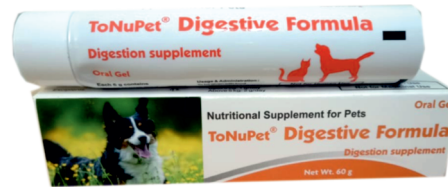
ToNuPet® Digestive Formula