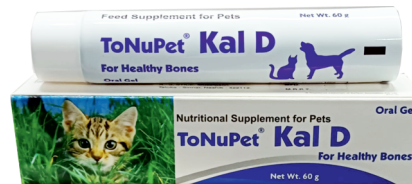
ToNuPet® Kal D