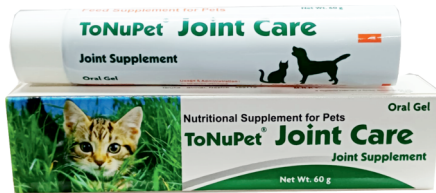
ToNuPet® Joint Care