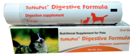
ToNuPet® Digestive Formula