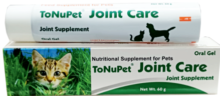
ToNuPet® Joint Care