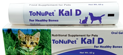
ToNuPet® Kal D